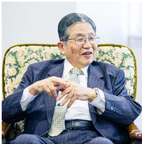
Prof. Akira Fujishima

In 2017, YNU accepted over a thousand international students, which accounts for more than 10 percent of the total of about 10,000 enrolled students. We intend to accept even more international students and encourage Japanese students to study abroad, whether short- or long-term.