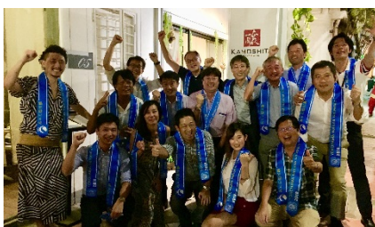
Singapore Alumni meeting group photo