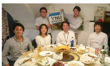
Moscow Alumni meeting group photo