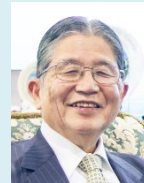
Director of Tokyo University of Science Photocatalysis International Research Center Akira Fujishima

Born in 1942 in Tokyo. In 1966, he graduated from the Department of Electrical Engineering at the College of Engineering, YNU. Subsequently, he served as a lecturer at Kanagawa University, a professor at the University of Tokyo, the ninth president of Tokyo University of Science, and various other roles before assuming his current positions as the director of the Photocatalysis Museum and the chairperson of Kawasaki Civic Academy, among others. He is a cultural contributor, a recipient of the Order of Culture, an honorary doctorate recipient and the Proud Alumni of YNU. He specializes in photoelectrochemistry and functional materials chemistry. He discovered the phenomenon of photocatalytic water decomposition.