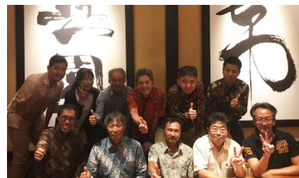
Indonesia Alumni meeting group photo