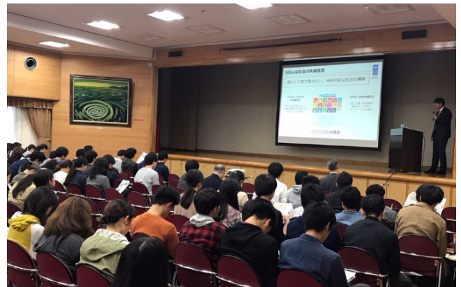
Special lecture by Director Kondo, UNDP Representation Office in Tokyo

For details see: https://www.ynu.ac.jp/hus/kokusais/21637/detail.html