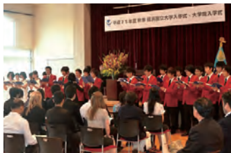
Welcome songs from YNU Mixed Chorus