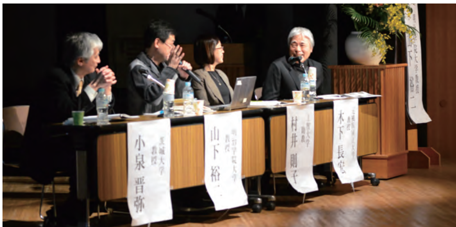
Panel Discussion Part 1

YNU students and local citizens attended the symposium and listened eagerly to keynote lectures and panel discussions.