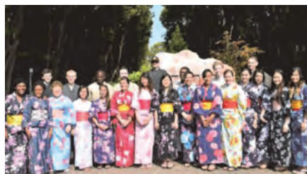
In front of the monument

and increase the number of overseas visitors to the country.