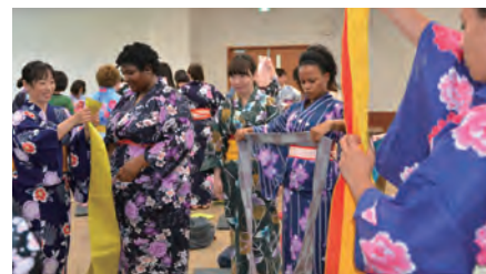
Tried wearing the Yukata

Website (Eng): http://www.ynu.ac.jp/hus/kokusais/9604/detail.html