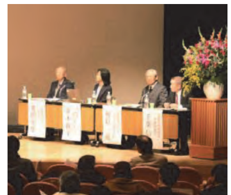
Panel Discussion Part 2

Website(Eng): http://www.ynu.ac.jp/hus/kokusais/9150/detail.html