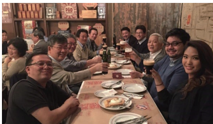
Making a toasting to the reunion

Details : http://www.ynu.ac.jp/hus/alumni/14668/