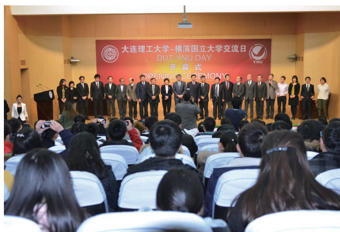
Greeting of DUT and YNU Representatives