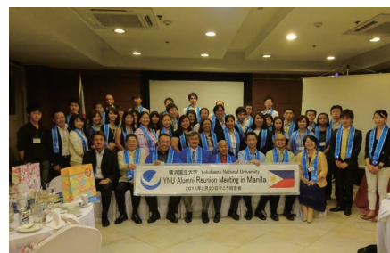
Year 2015 YNU Philippines Alumni Reunion

Details : http://www.ynu.ac.jp/hus/alumni/13458/