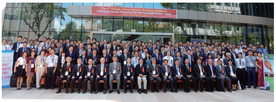
The 3rd Viet Nam - Japan University Presidents' Conference Participants at Full Strength