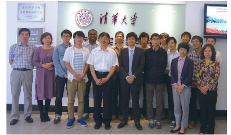
YNU Internship members

lectures which Tsinghua University students actually practiced. Besides, they toured the power electronics laboratory, the information media laboratory and the experimental facility of Department Automatic Control of Tsinghua University. The substantial research and educational organization of the Chinese top university are remarkable.