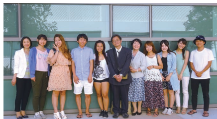
YNU Summer Intensive English Camp members at San Diego State University

Details : ☞ http://www.kokusai-senryaku.ynu.ac.jp/hus/kokusais/14815/