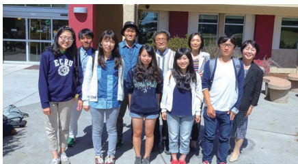
YNU Summer Intensive English Camp members at California State University, Monterey Bay

Details : ☞ http://www.kokusai-senryaku.ynu.ac.jp/hus/kokusais/14815/