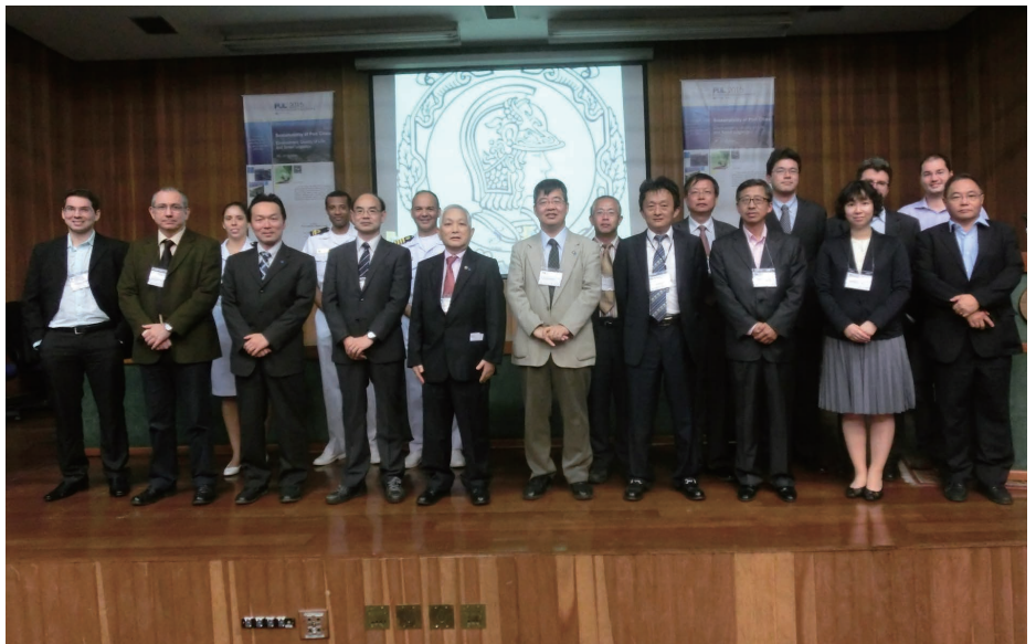
Commemorative Photo of PUL2015

Details : http://www.kokusai-senryaku.ynu.ac.jp/hus/kokusais/14818/