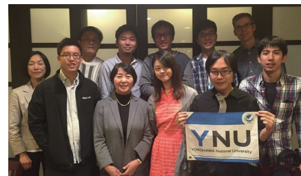
YNU SF-Bay Area Alumni Preparation Meeting commemorative photo

Details : http://www.ynu.ac.jp/hus/alumni/14549/