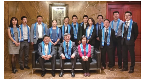
Year 2015 YNU Mongolia Alumni Reunion

Details : http://www.ynu.ac.jp/hus/kokusais/14625/detail.html