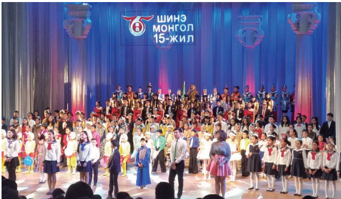
Students performing on the stage

Details : http://www.ynu.ac.jp/hus/kokusais/14625/detail.html