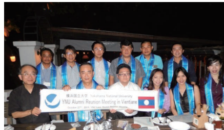
Year 2015 Laos Alumni commemorative photo

Details : http://www.ynu.ac.jp/hus/alumni/14934/