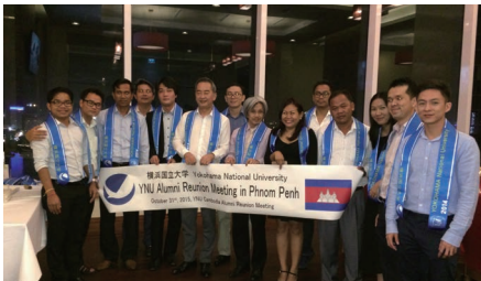
Year 2015 Cambodia Alumni

Details : http://www.ynu.ac.jp/hus/alumni/14933/