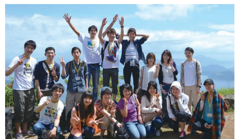
Short-term Study Abroad Program members

Details : ☞ http://www.ynu.ac.jp/hus/kokusais/13538/detail.html