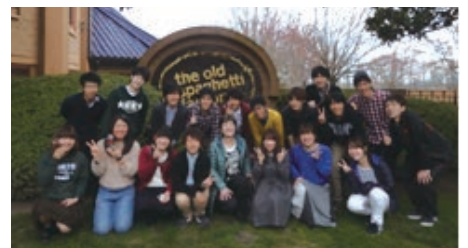
America Plus Fields Study program members

Details : ☞ http://www.ynu.ac.jp/hus/kokusais/13537/detail.html