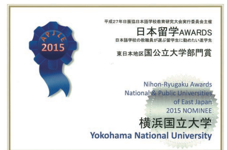
Certificate of Commendation, Nihon Ryugaku-Awards

Details : http://www.kokusai-senryaku.ynu.ac.jp/hus/kokusais/14645/