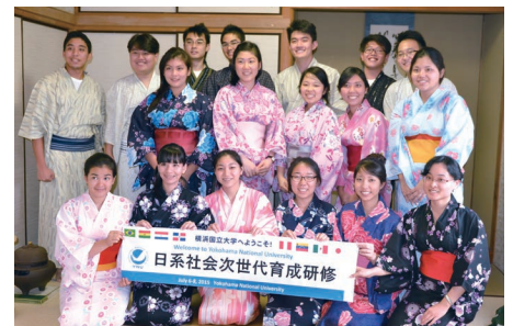
Wearing Kimono with smiles

Details : ☞ http://www.ynu.ac.jp/hus/kokusais/14457/detail.html