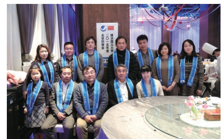
Year 2015 YNU Beijing Alumni Reunion