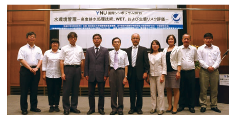
Commemorative Photo of all Lecturers

Details : http://www.kokusai-senryaku.ynu.ac.jp/hus/kokusais/14342/