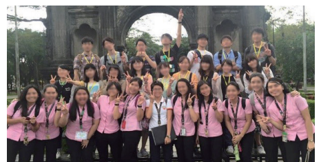
Group photo of students

term Study Abroad Program was held at the University of Santo Tomas in the Philippines. 16 YNU students attended the program.