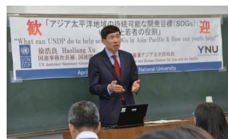
UNDP Director Xu

students, and international students. The lecture was focused on importance of young people's energy to help achieve Sustainable Development Goals (SDGs) with detailed examples. It inspired many of the participants; one of the students commented that he was able to understand SDGs more deeply.