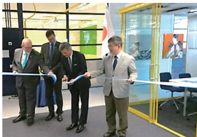
Ribbon cutting by President Hasebe

For details see: http://www.ynu.ac.jp/hus/kokusais/16659/detail.html