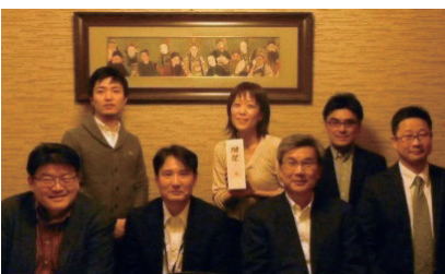
2016 YNU Moscow Alumni meeting group photo

For details see: http://www.ynu.ac.jp/hus/alumni/15700/detail.html