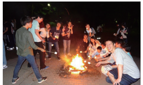
Students beside a campfire

Brazil said, "The Camp was so much fun. Please let me know if I can help in the coming events!" A student from Russia said, "I'm not good at making new friends, but this camp helped me a lot with talking with other participants and getting to know each other."