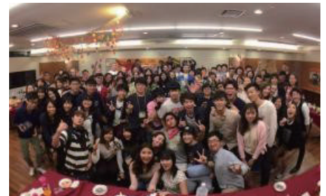
Students enjoying the Welcome Party

dents and approximately 180 Japanese students enjoyed founding international friendships and joining activities such as Japanese calligraphy and a Bingo game.