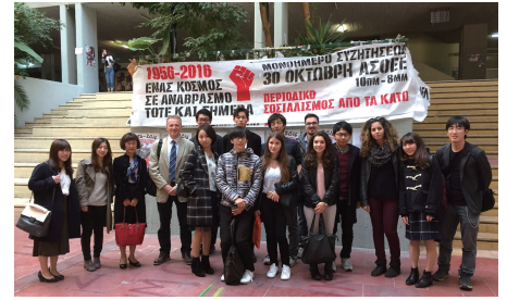
The 11 th Euro-Japan Dialogue at University of Athens

presented on the topics such as University Tuition Fees and Migrant Labor. In Athens, the main topic of discussion was on the economic benefits of a multilingual society. A lively discussion on the role of English in Greek and Japanese societies followed. The Euro-Japan Dialogue was a great success in large part. Thanks to the hard work, organization and gracious hospitality of our European partners at University of Bucharest and University of Athens.