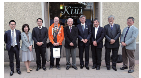
2016 YNU Europe Alumni meeting group photo

For details see: http://www.ynu.ac.jp/hus/alumni/16637/detail.html