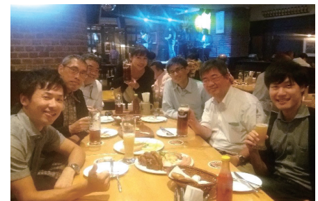
2016 YNU Indonesia Alumni meeting group photo

For details see: http://www.ynu.ac.jp/hus/alumni/17309/detail.html