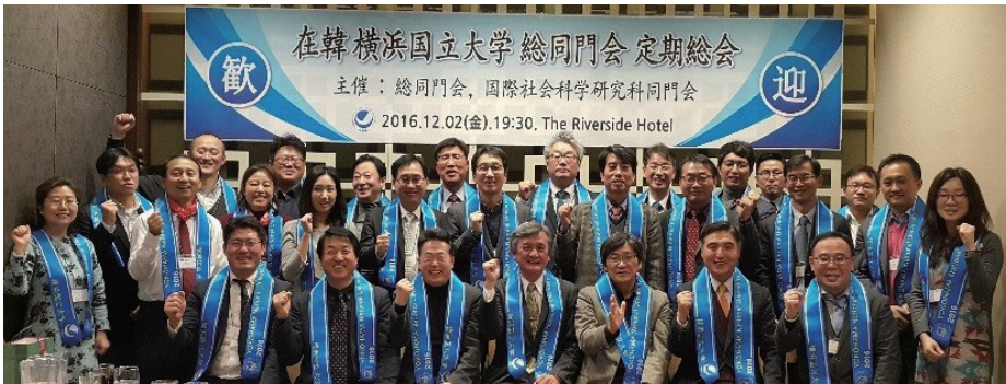
2016 YNU Korea Alumni meeting group photo

For details see: http://www.ynu.ac.jp/hus/alumni/17360/detail.html