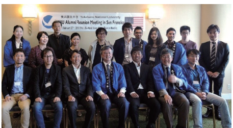
2016 USA West Coast Alumni meeting group photo

For details see: http://www.ynu.ac.jp/hus/alumni/15629/detail.html