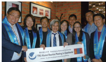
2016 YNU Mongolia Alumni meeting group photo

For details see: http://www.ynu.ac.jp/hus/alumni/16889/detail.html