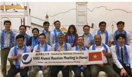
2016 YNU Vietnam Alumni meeting group photo

For details see: http://www.ynu.ac.jp/hus/alumni/17011/detail.html