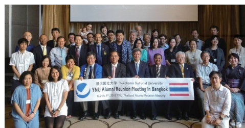
2016 YNU Thailand Alumni meeting group photo

For details see: http://www.ynu.ac.jp/hus/alumni/15630/detail.html