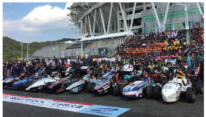
YNU machine (3rd from the right) with other competitors