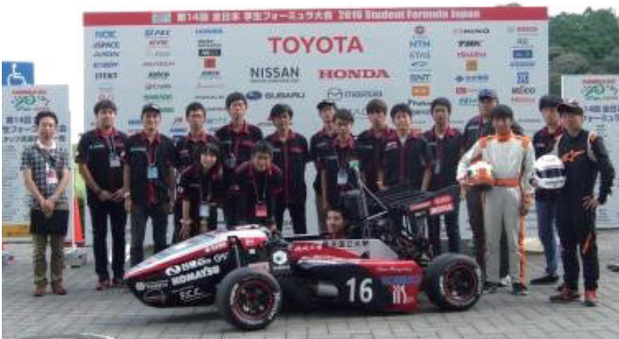
YNFP member's group photo

tomobile Manufacturers Association) Chairman Award.