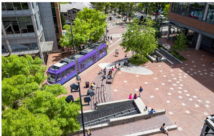
Tram running through PSU campus