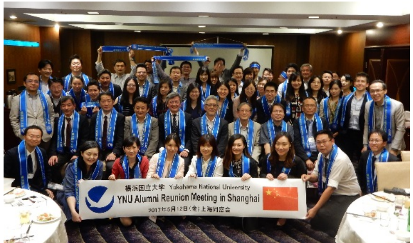
Shanghai Alumni meeting group photo

For details see: http://www.ynu.ac.jp/hus/alumni/18306/detail.html