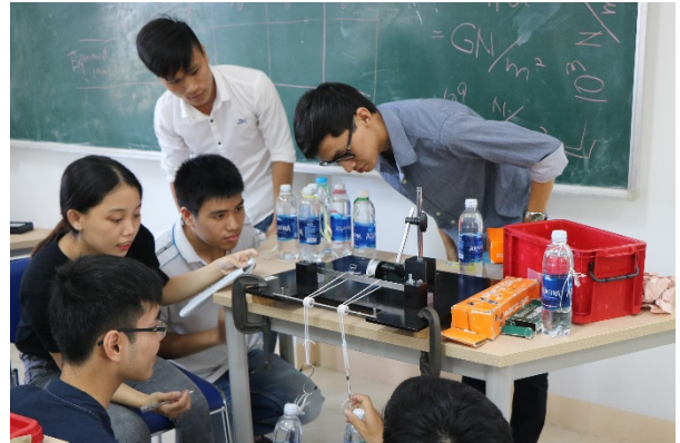
Photo of experiments

Special intensive lecture at the University of Da Nang (UD), University of Science and Technology with UD-YNU International Branch