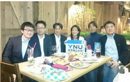
Moscow Alumni meeting group photo

For details see: http://www.ynu.ac.jp/hus/alumni/19474/detail.html