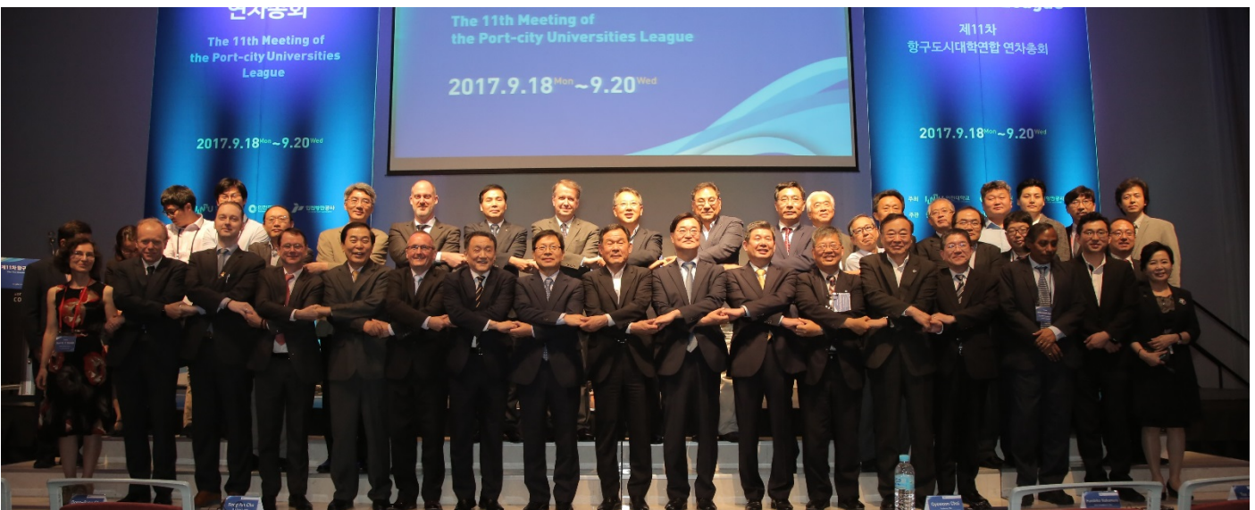
Commemorative Photo of the 11th PUL meeting