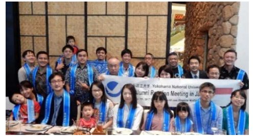
Indonesia Alumni meeting group photo

For details see: http://www.ynu.ac.jp/hus/alumni/19037/detail.html