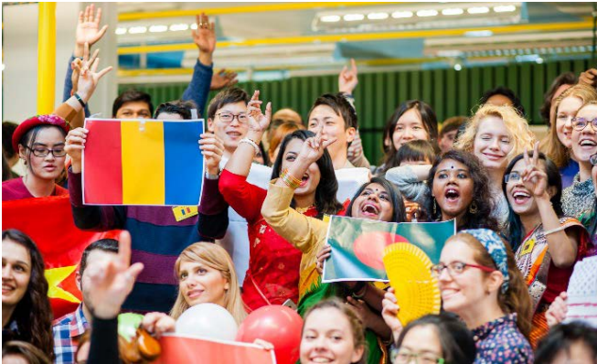
Memorial group photo after the event

“Festival of Cultures and Co-operation” celebrates cross-cultural exchange and international cooperation at the University of Oulu, Finland (OYO)