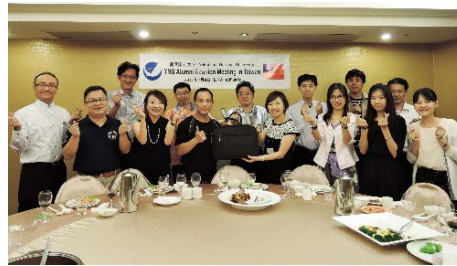
Taiwan Alumni meeting group photo

For details see: http://www.ynu.ac.jp/hus/alumni/18622/detail.html